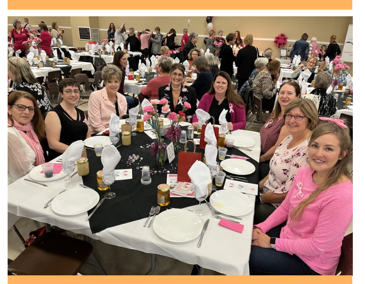
Members of Ross Memorial's Diagnostic Imaging team attended the Dragon Flies' Diva Night event

With this gift, the Dragon Flies' cumulative donations to the RMH Foundation total $410,300. Through their efforts, the Dragon Flies have helped the Hospital to acquire the best diagnostic technology — including 3D Mammography and MRI — and to become an Accredited Breast Assessment Centre with a High Risk Breast Screening program, affiliated with Cancer Care Ontario.