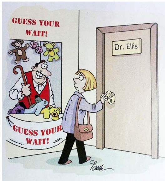
Saturday Evening Post