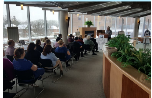
On Dec. 12th a special event was held at RMH to recognize the 100th anniversary of the history-making vote and the local nurses who served during WWI. Learn more at www.TheirVotesCounted.ca .