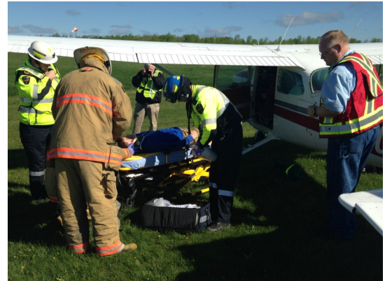
Teams respond to mock plane crash. Those exposed to the hazardous chemical are decontaminated outside the hospital before being treated.

Responding to a CBRNE emergency involves the hospital's community partners, including the fire department, police, paramedics and the media. It was a learning opportunity for all organizations involved.