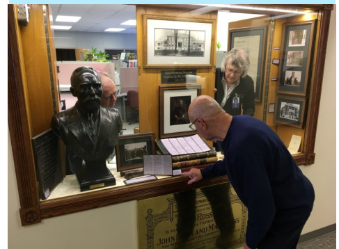
They created an inventory of ledgers, images, artifacts and newspaper clippings.