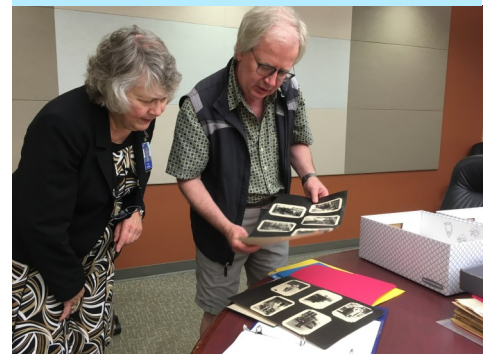
Part of their work involved identifying the people featured in old photographs.