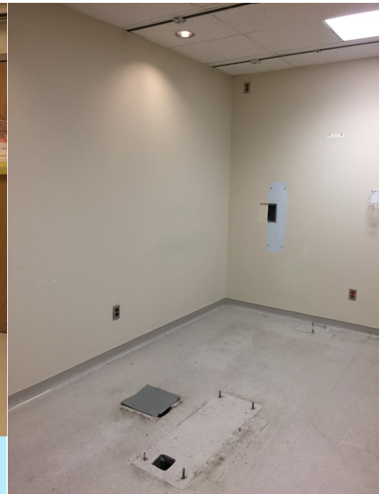
X-ray Room #3 before renovations began (left) and after equipment was removed on July 3 (right)