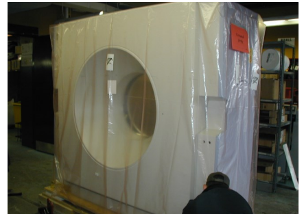
First CT delivered Feb. 13, 2001