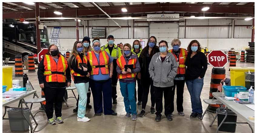
Members of your community COVID-19 Vaccination Clinic team at the Lindsay EX