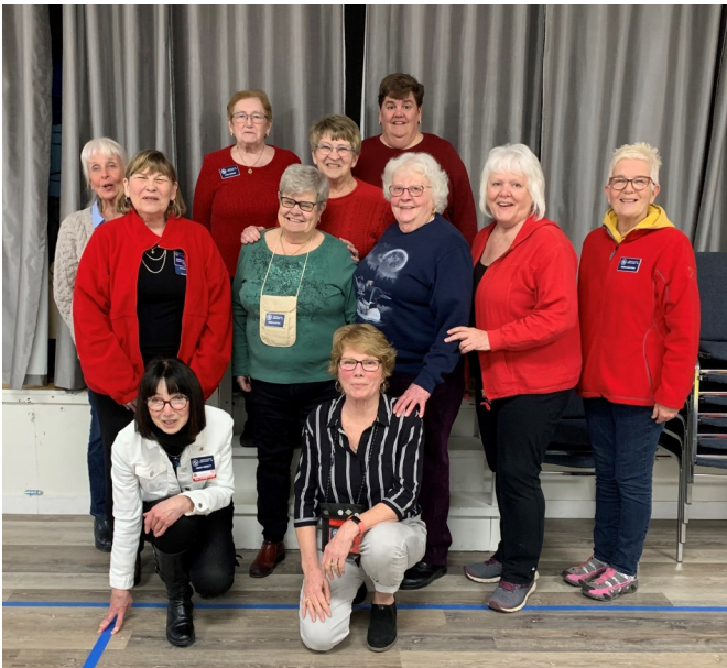
Members of the Kinette Club of Bobcaygeon

Current hospital funding priorities include a new CT Scanner and a new MRI machine, both of which reached end-of-life after ten years of near constant use. Access to this precision imaging technology is imperative for