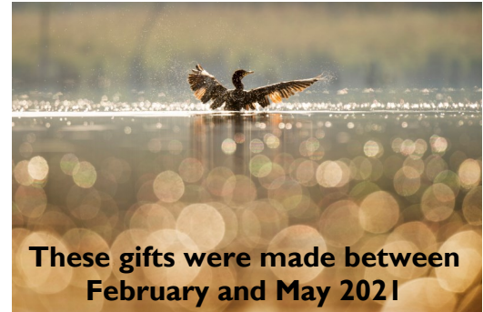
These gifts were made between February and May 2021

When we lose someone dear to us, it can be comforting to share stories of happy times, and to remember the things that made them so special. Often we want to do something special in their memory.