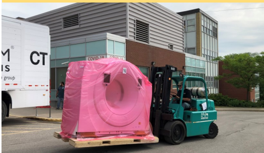
The community’s new CT Scanner was delivered on June 7, 2021